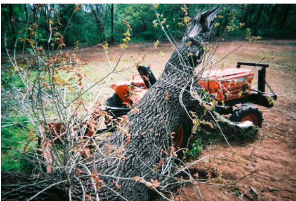
David Gates tractor and tree (See page 1).