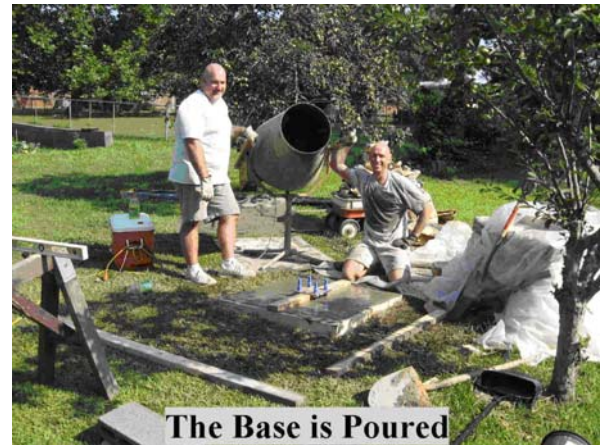
The Base is Poured