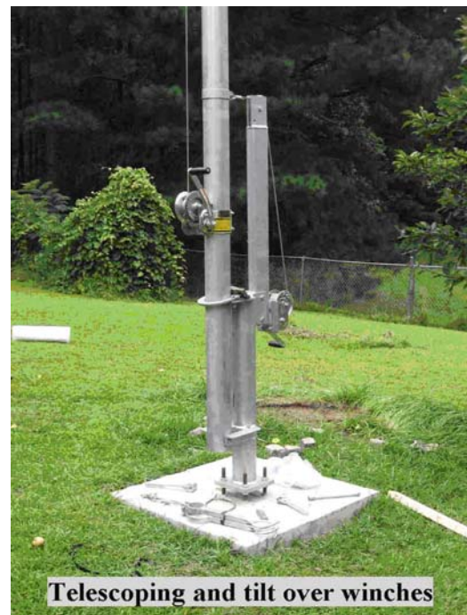
Telescoping and tilt over winches